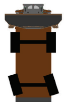
Rear wheel steering